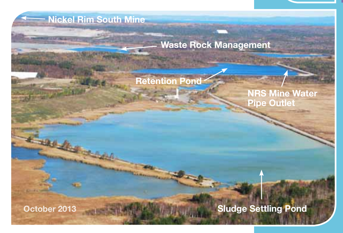
Figure 4 | Water Management Area

Finally, extreme heat days contribute to increased temperatures underground and threaten worker safety. As surface temperatures rise, underground temperatures also rise because of incoming ventilation air. Provisions under the Occupational Health and Safety Act in Ontario require production be halted when temperatures exceed 31 degrees Celsius. In recent years, the Glencore mines in Sudbury have experienced an increase in the number of days when production has been halted due to high temperatures underground.