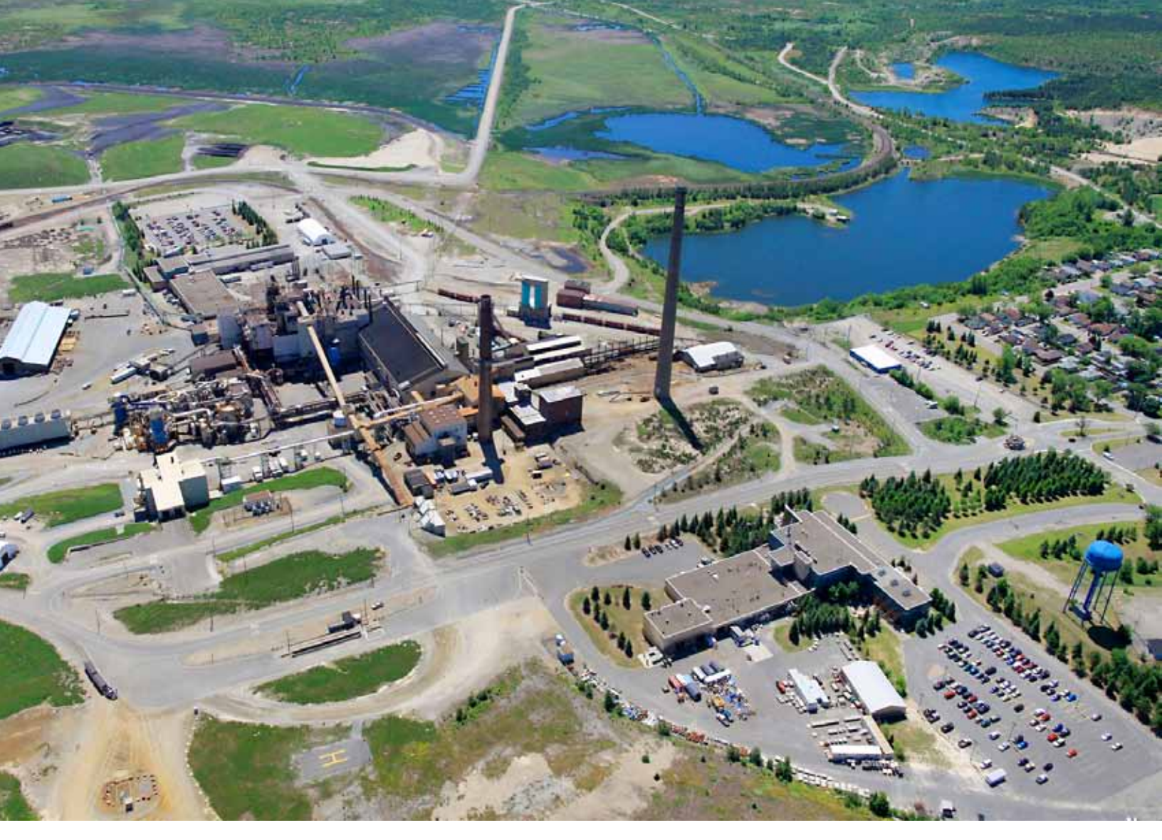
Figure 1 | Glencore Sudbury Smelter